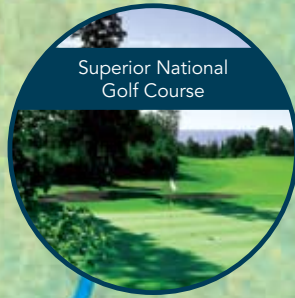
Superior National Golf Course