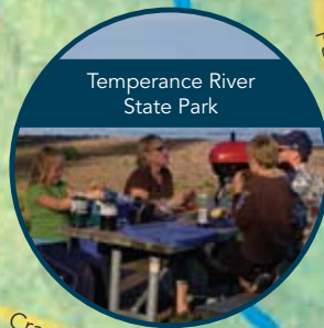
Temperance River State Park