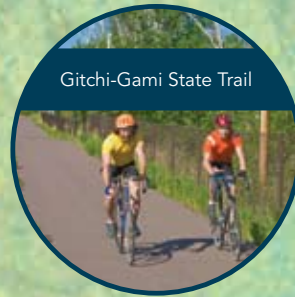
Gitchi-Gami State Trail