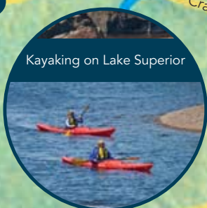
Kayaking on Lake Superior