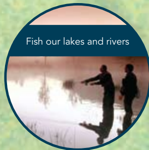
Fish our lakes and rivers