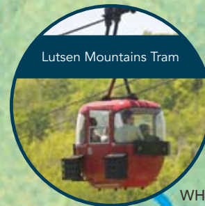
Lutsen Mountains Tram